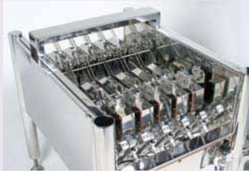
Main body without conveyor