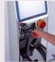
CF card slot